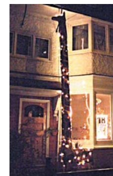
Geoffrey Giraffe's last appearance at 193 Marlborough Avenue, 2006

Could you extend the Advent calendar to Cottingham? He