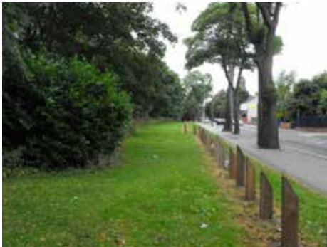
4... What was its name?