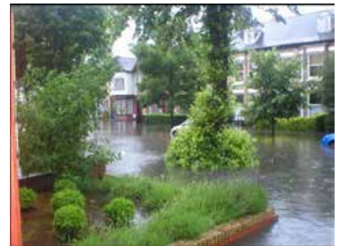
6... Where and when?