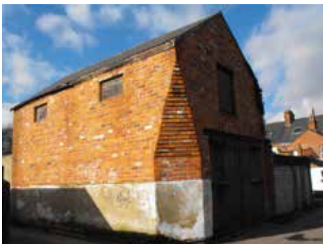
7... Where's this curious corner?