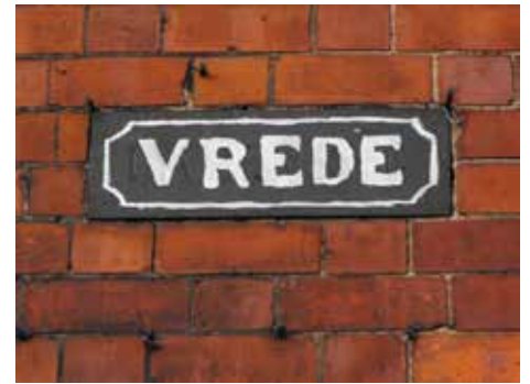
3 ... What was the previous name?