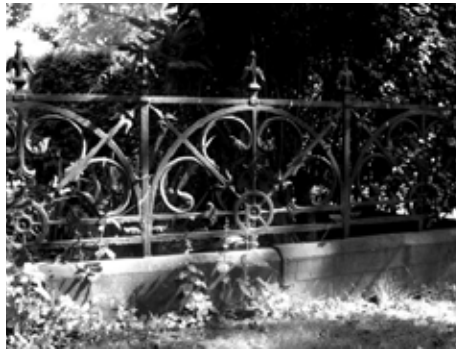
2... Where are these railings?