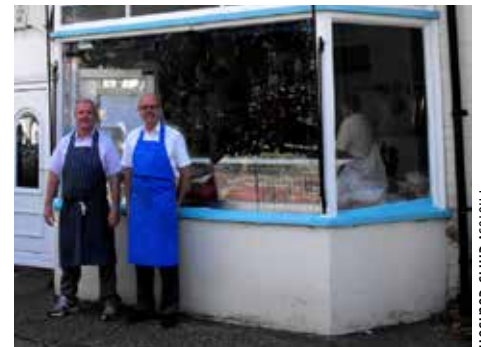
9... Who retired?