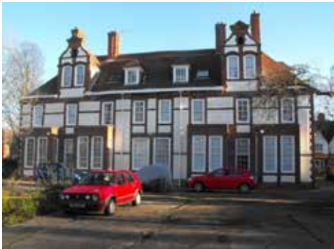
1... The back of where?

The answers will be published in the December issue.