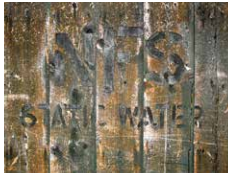
5... Where is it? What does it mean?