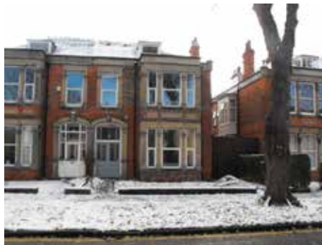
8... Who lived here?