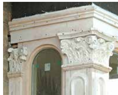
Reproducing window details