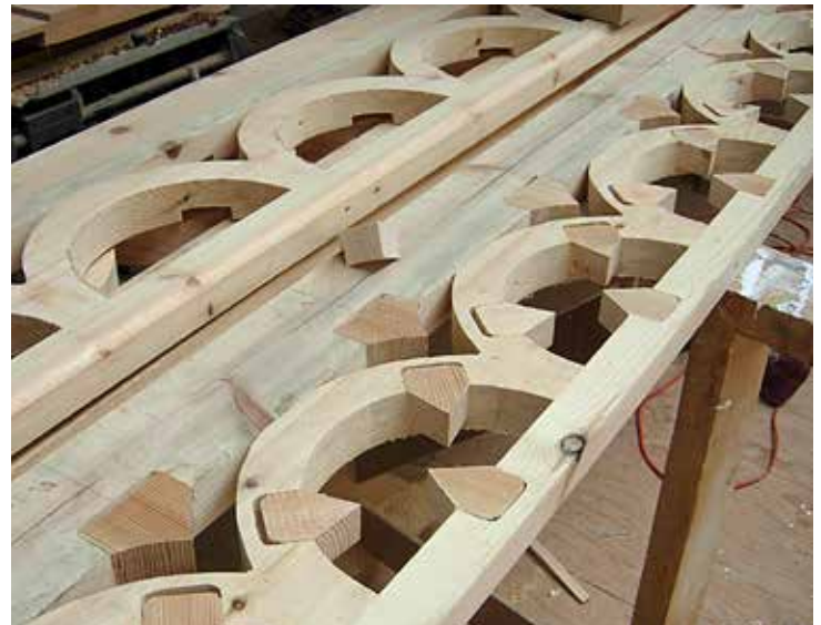
Bargeboards and windows

Unfortunately, there are no grants available to help with the cost of these works, but estate agents tell us that 'original features' are a good selling point.