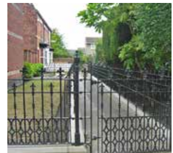
Railings and gates

Boulevard and Coltman Street have now joined us in having 'Article 4 Directions', meaning householders need planning permission to make changes to windows, bays, porches and doors. And we've been recommending to residents the benefits of having an active Residents' Association!